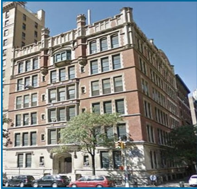
555 West End Avenue